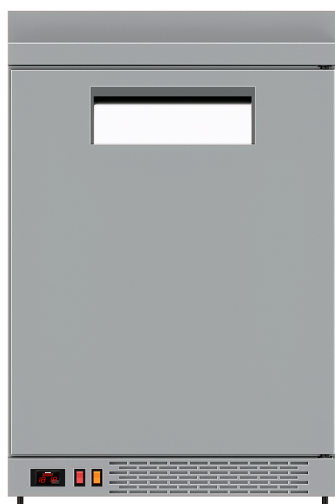
Стел барный ТМ101 (Гелевая дверь и столешница с бортом)