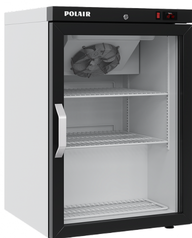
DP102-S с осевым вентилятором